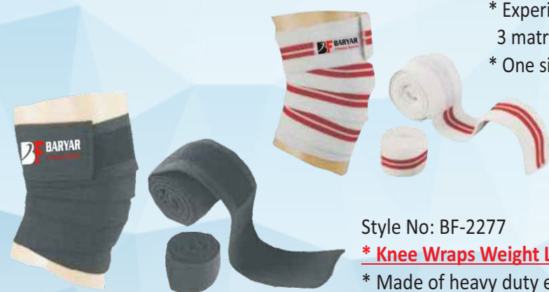
Style No: BF-2277